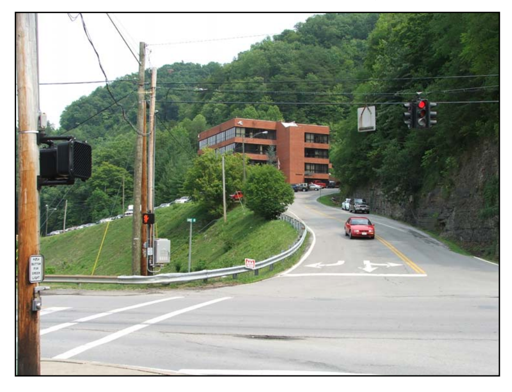
Summit Drive approach to KY 1426 intersection