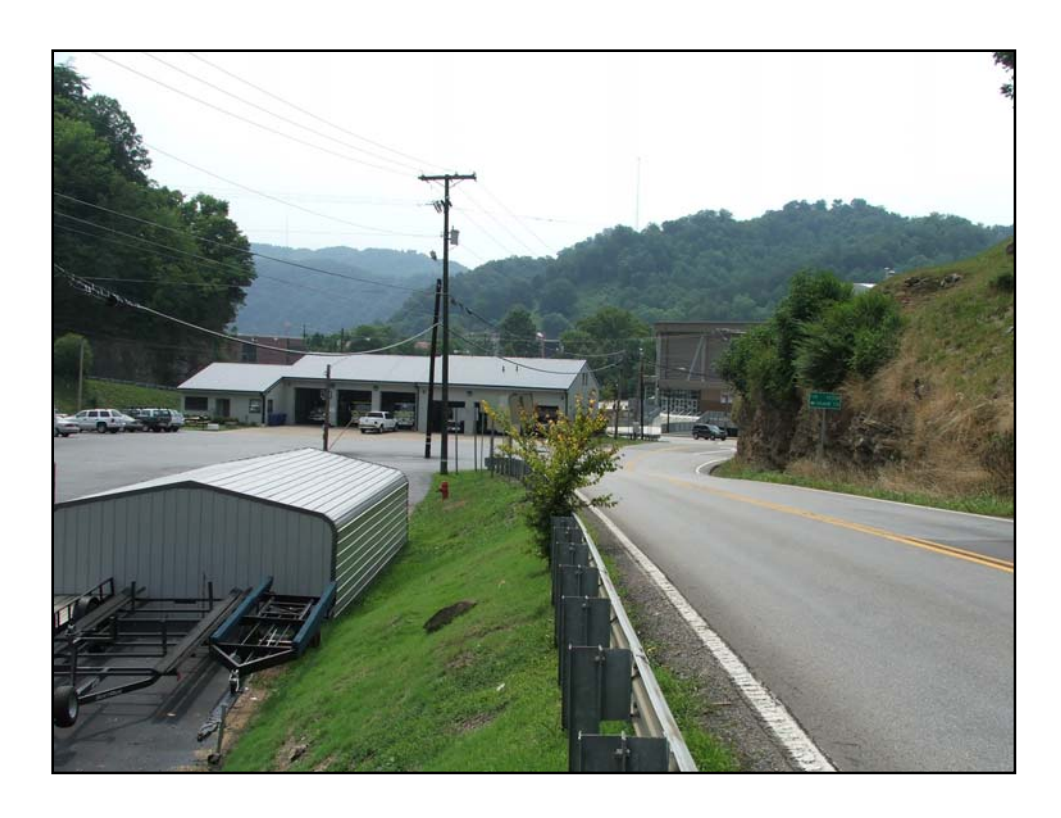
View along KY 1460 to intersection with KY 1426