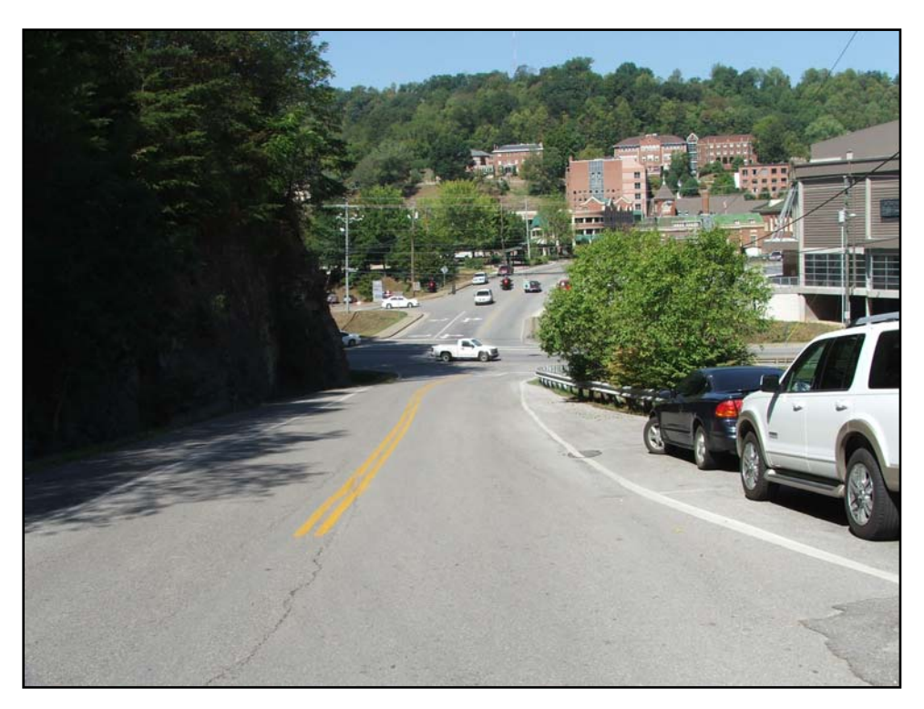
View of KY 1426 intersection with Huffman Avenue as seen from Summit Drive