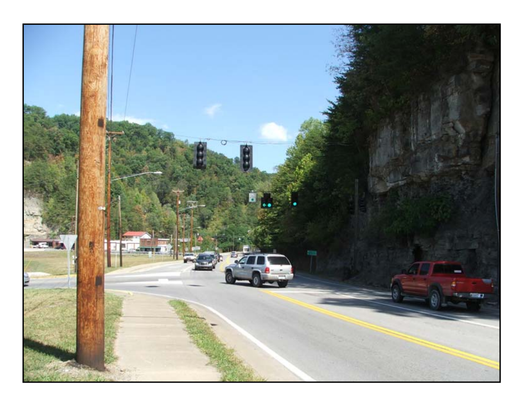
Intersection with Combs Avenue near rockfall area