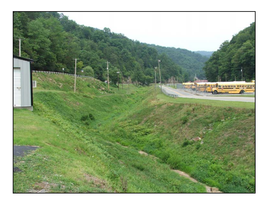
Area between KY 1460 and school access road facing east