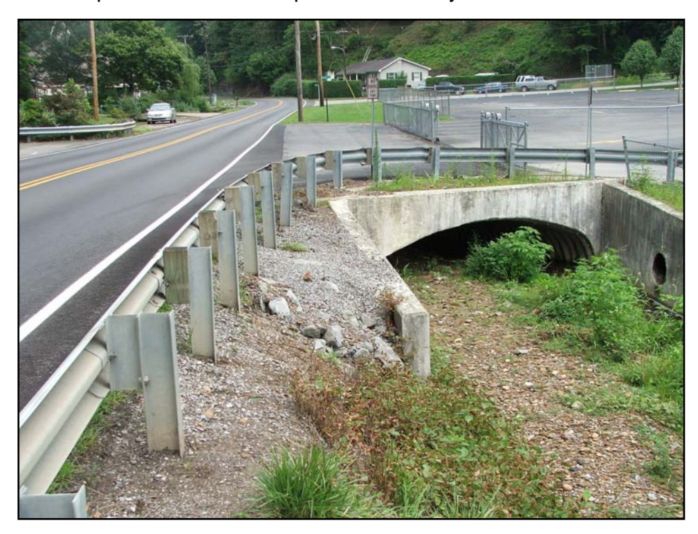
Chloe Creek Culvert, passing under KY 1460.