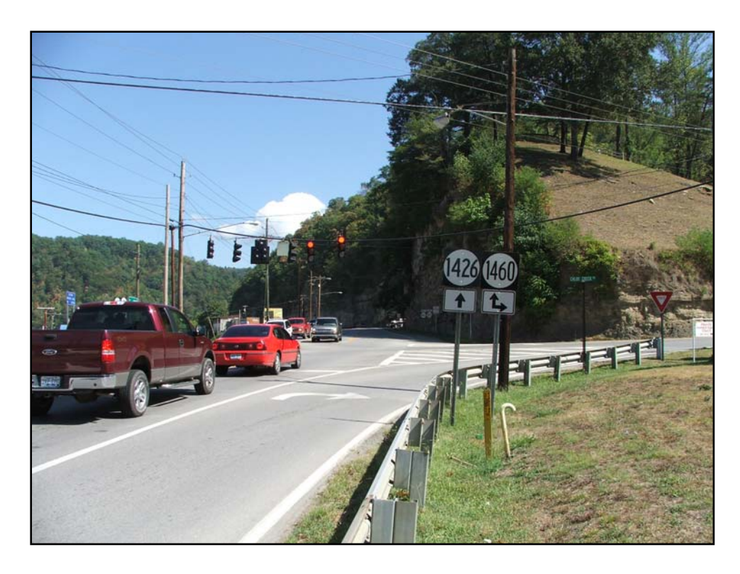
View along KY 1426 facing North from KY 1460 intersection