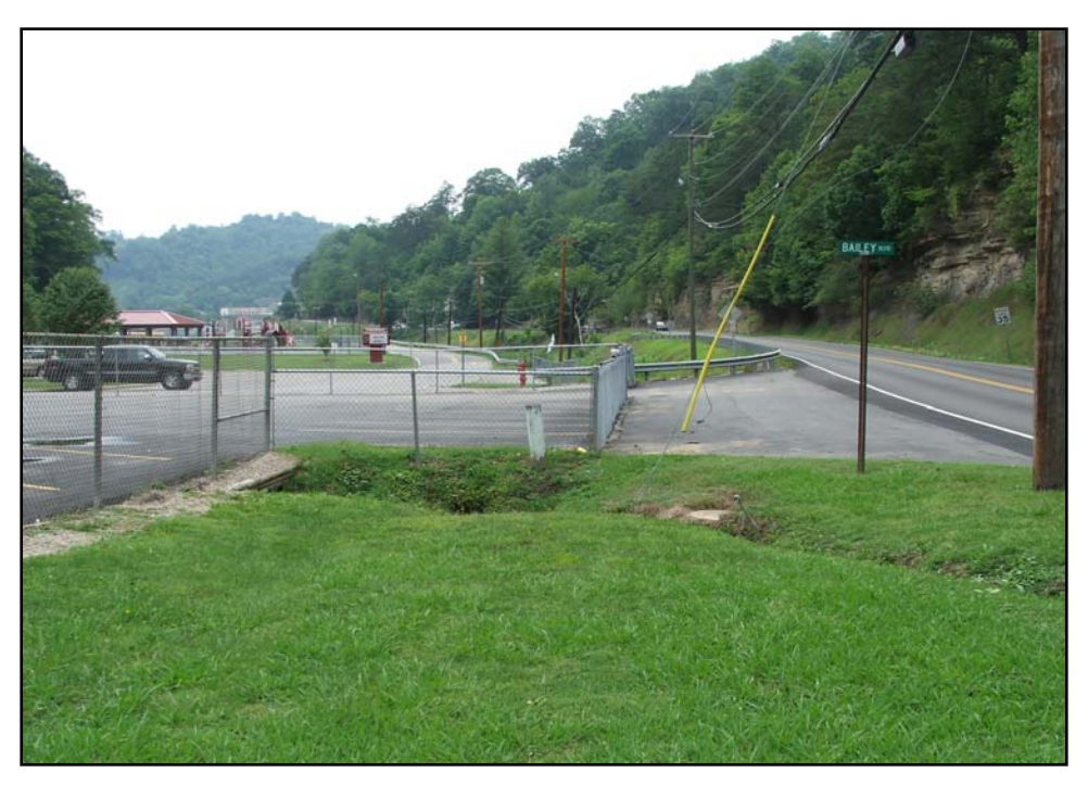
KY 1460 at Bailey Blvd near Pikeville Elementary. Chloe Creek passes under the roadway at this location; local reports indicate water pools in roadway at times.