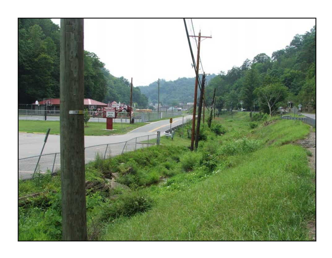
View West along KY 1460 and Chloe Creek