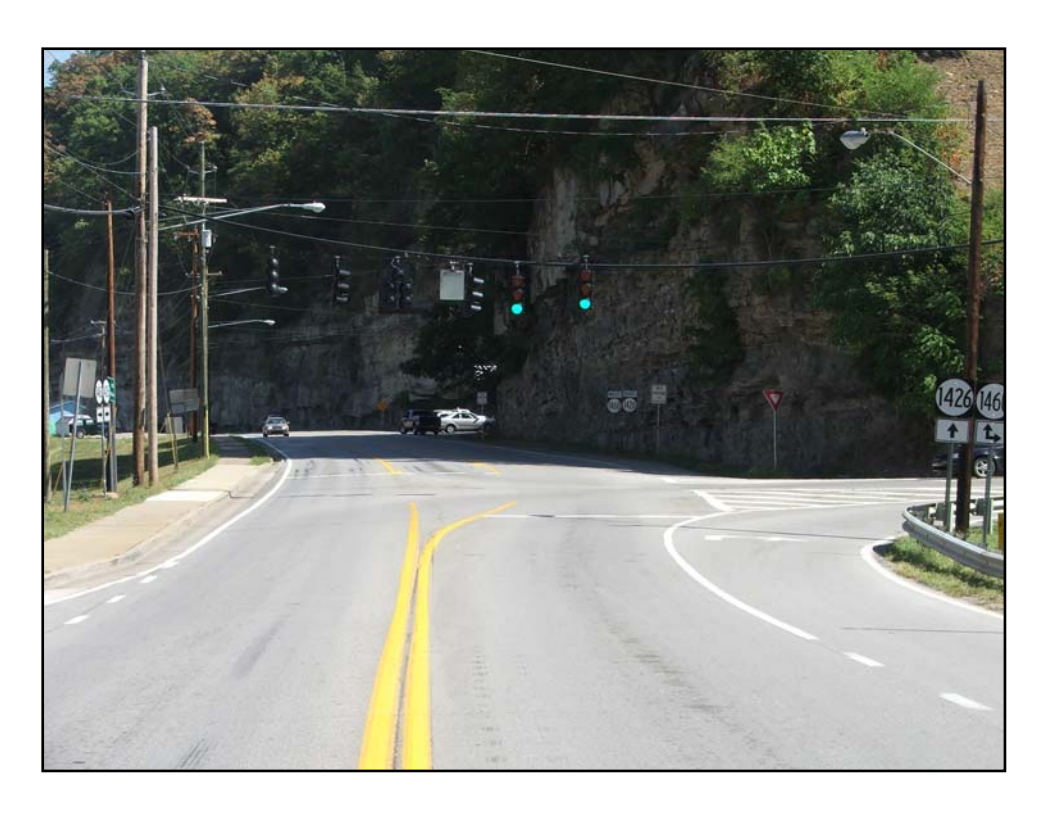
Rockfall area east of KY 1426