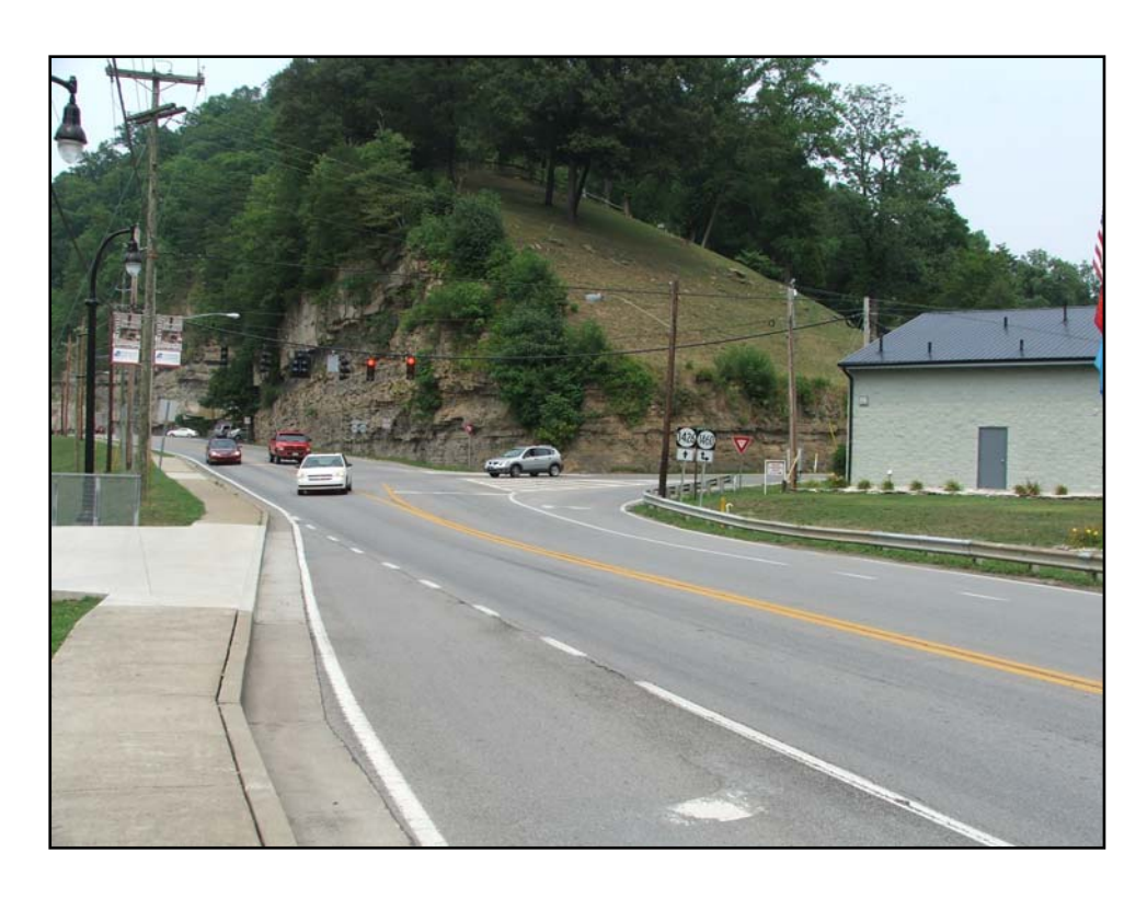
Cut slope at KY 1426/KY 1460 intersection with rockfall hazard. Dils Cemetery sits atop ridge