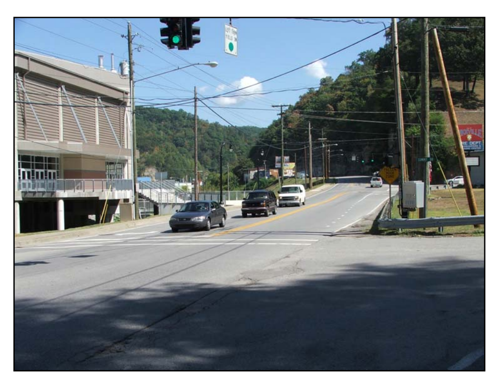
View Northeast along KY 1426 from intersection with Summit Drive/Huffman Avenue. Eastern KY Expo Center stands to the left of KY 1426