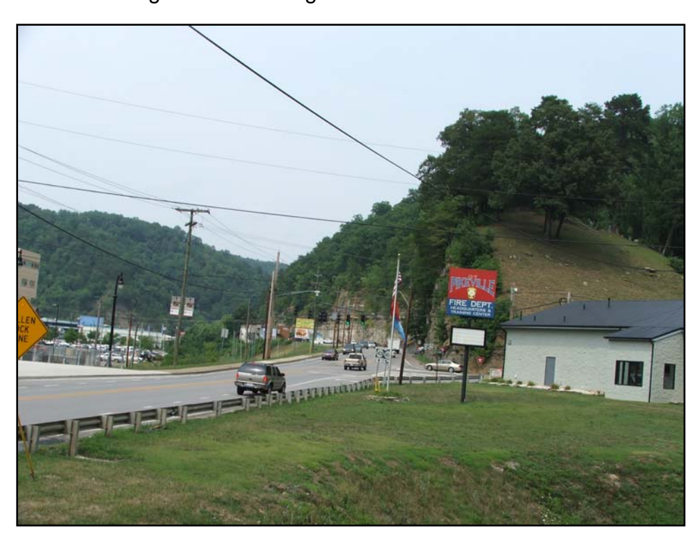
KY 1426/KY1460 intersection, looking North