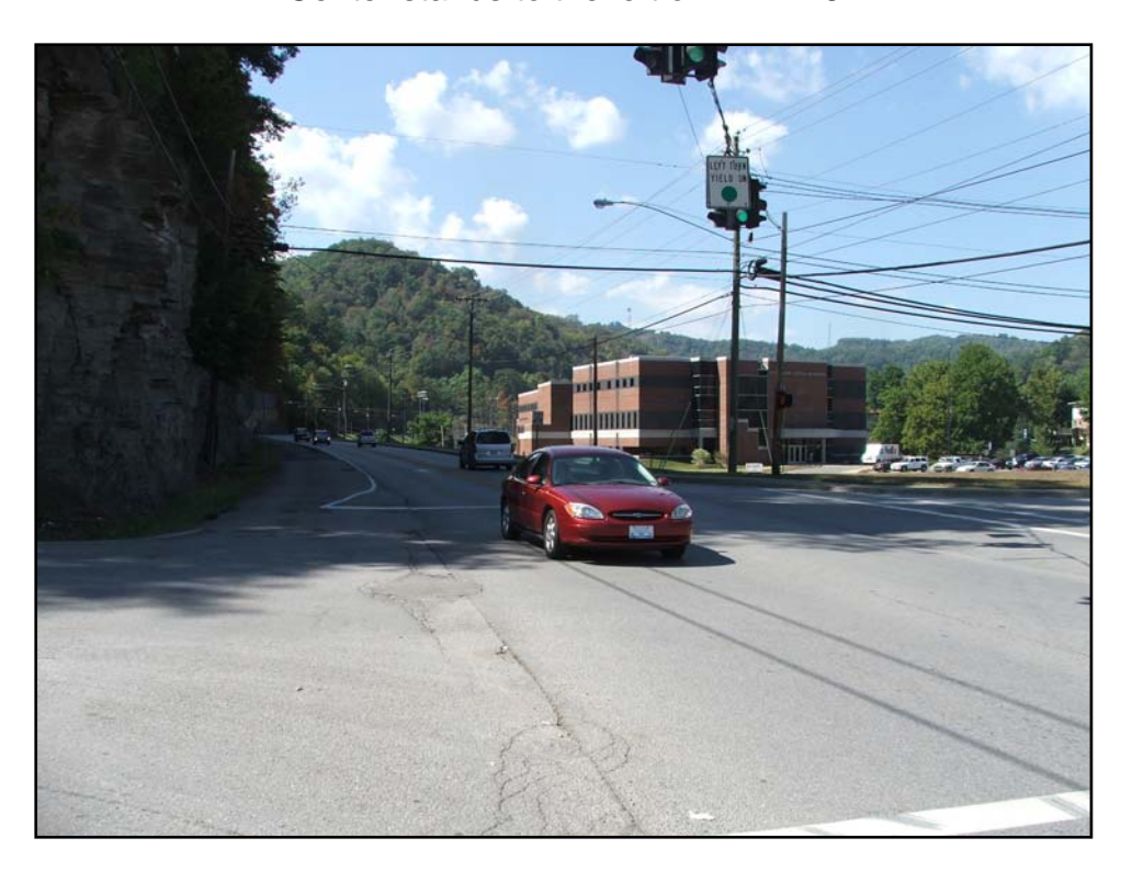
Southern KY 1426 approach at Huffman Avenue/Summit Drive intersection